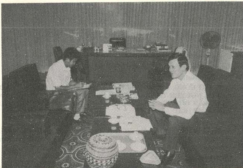
Chairman Trương Tấn Sang (right) with EDR reporter

The 7th Conference of VCP Central Committee (7th term) has arrived at the decision on developing industry and technology from now till 2000 in the direction of industrializing, modernizing the country and building working class in the new era.